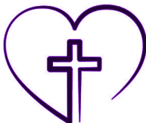
Table of Grace

The Missions Committee encourages you to give generously to those in need of warmth this winter.